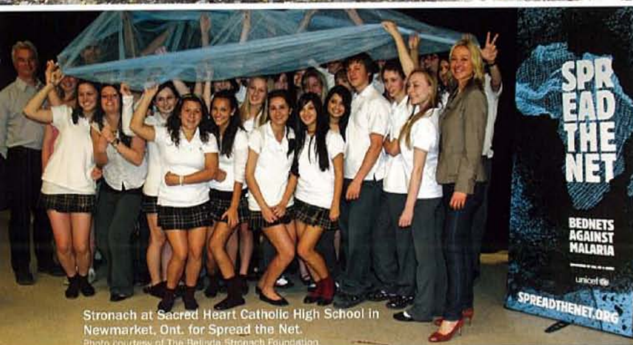
Stronach at Sacred Heart Catholic High School in Newmarket, Ont. for Spread the Net.

entering because it's also extremely rewarding." She's particularly pleased that younger women are showing greater interest in political life. "What I like is they say, 'I don't have to conform to a typical stereotype, I can be proud of who I am and make a difference.'" And though she squirms at the idea of being a role model, Stronach still takes pride knowing she may have inspired others. While running for the Conservative leadership, Stronach recalls meeting parents and hearing them recount how their daughters excitedly asked them, "You mean a woman can be prime minister of Canada?" (obviously too young to remember Kim Campbell). That belief in possibilities is powerful, says Stronach. "The great thing is when a young person sets a higher goal for themselves, thinking this is something they can actually do."