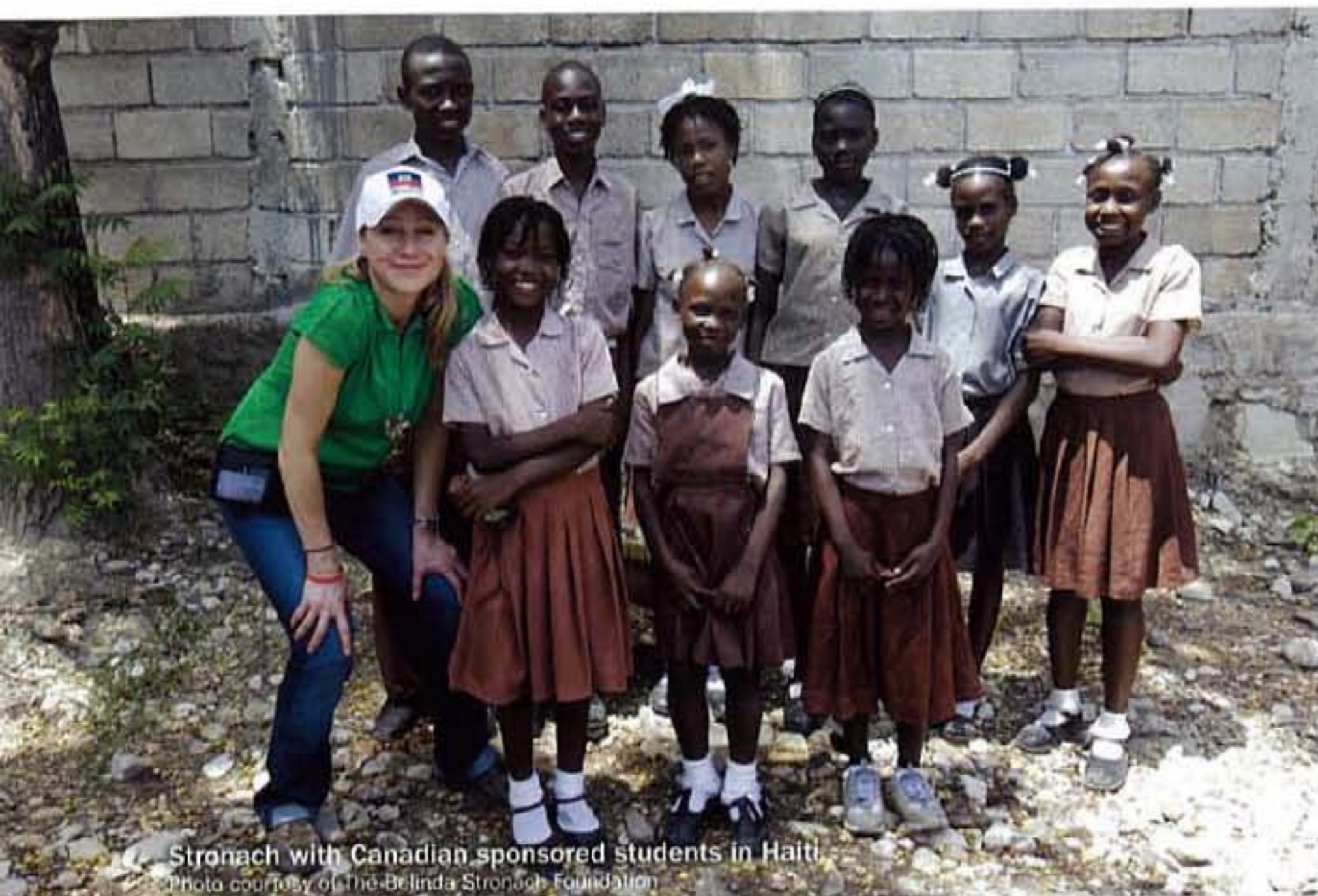
Stronach with Canadian sponsored students in Haiti.